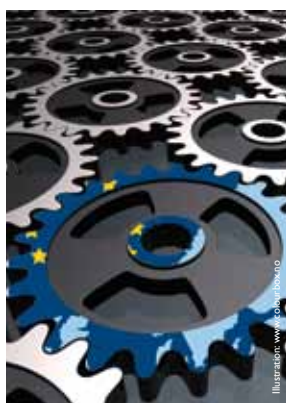
Contribution of NSR 2020 to Europe 2020 Strategy Flagships

This strategy intends to provide a framework for policy integration and coherent development of the NSR. The strategy sets out to promote the performance in selected target areas and to tackle priorities for the development of the NSR. It aims to remove internal market bottlenecks and improve the business environment. It sets out priority actions in order to achieve Europe 2020 Strategy objectives and each of the priorities supports several of the Europe 2020 Strategy flagships as illustrated in Table IV.